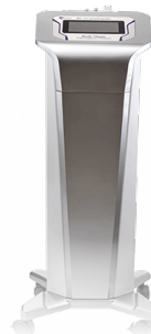
Body Shape RF