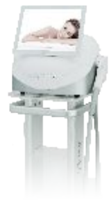
Extra - 818m

Hair Removal & Facial and Body Treatments