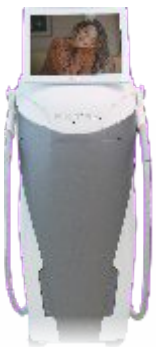
Extra - 818

Hair Removal & Facial and Body Treatments